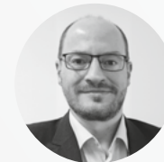
Klaus Puchbauer-Schnabel High Level Representative