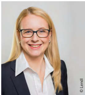
Margarete Schramböck, Austrian Federal Minister for Digital and Economic Affairs

After a long and successful history, the concept of Eureka is more relevant than ever in a setting where global framework conditions have fundamentally changed. The key social, political and economic